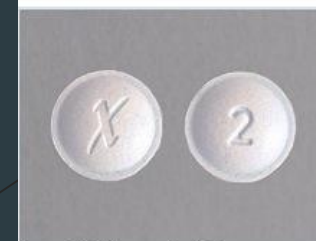
Xanax XR (alprazolam) 2 mg