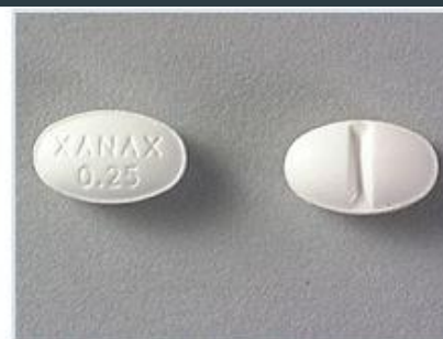
Xanax (alprazolam) 0.25 mg