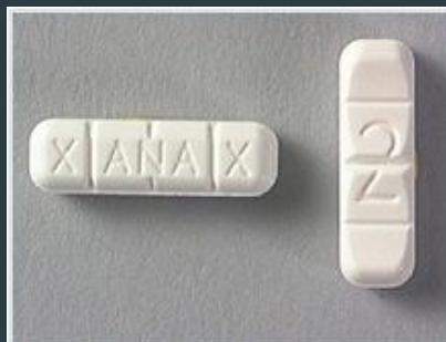
Xanax (alprazolam) 2 mg