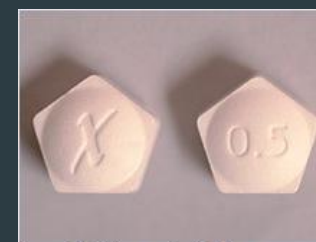
Xanax XR (alprazolam) 0.5 mg