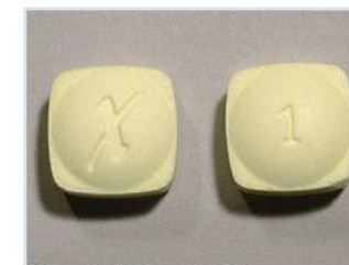
Xanax XR (alprazolam) 1 mg