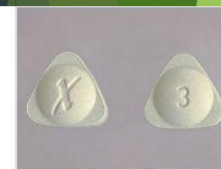
Xanax XR (alprazolam) 3 mg