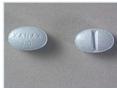
Xanax (alprazolam) 1 mg