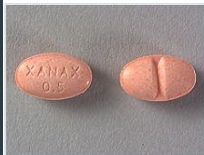
Xanax (alprazolam) 0.5 mg